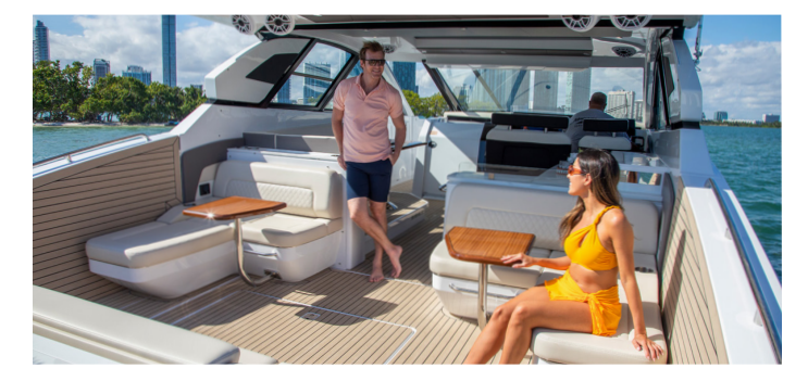
COCKPIT - Expand your swimming area by lowering both sides of the 50 GLS to convert them into a swim platform. The 50 GLS' cockpit features a midship galley and opposing L-shaped seating area, two aft-facing L-shaped seating areas, and additional bench seating. The transom area features a standard grill, sink, and storage.