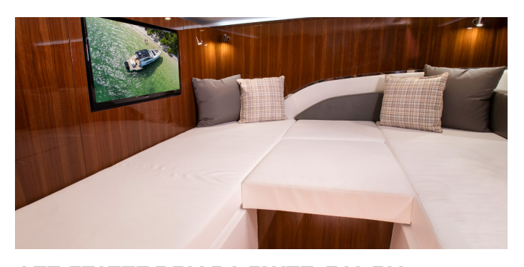
AFT STATEROOM & LOWER SALON The aft stateroom features a custom sized berth along with two facing chairs. A filler cushion can be placed to expand the berth area. The lower salon features a 32" Samsung TV, fridge, and microwave.