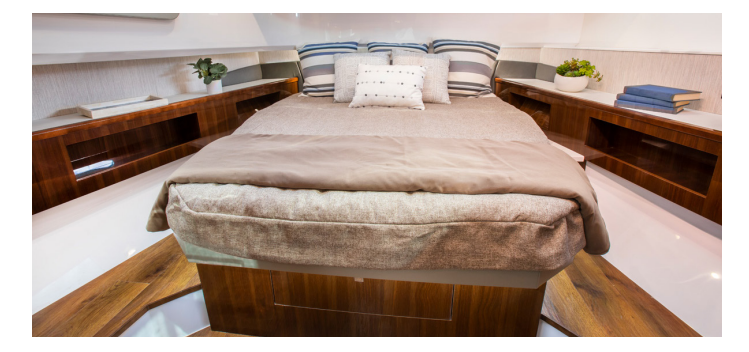
FORWARD STATEROOM - Need to rest for the night? The forward stateroom aboard the 50 GLS features a custom queen size berth, hanging locker, 32" Samsung TV, and personal reading lights. The French door for privacy and the skylight with opening porthole complete this room.