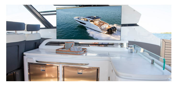
GALLEY - The galley features a fiberglass inlay sink, fridge, and storage. There is also an option for a second refrigerator. The galley is located in the cockpit for easy flow of conversation to guest sitting at the dinette. There is an optional pop up 55' TV.