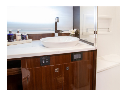
HEAD - The 50 GLS head features a sink, toilet, and separate shower stall. Storage hidden behind the mirror and underneath the sink allows you to tuck away personal items.